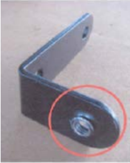
HOOD FIXING PLATE