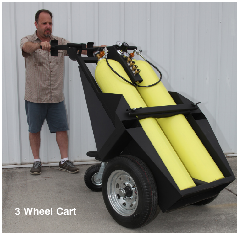
3 Wheel Cart