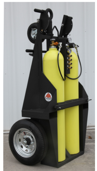
Store Upright For Smallest Footprint