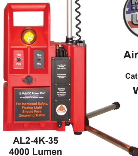
AL2-4K-35 4000 Lumen