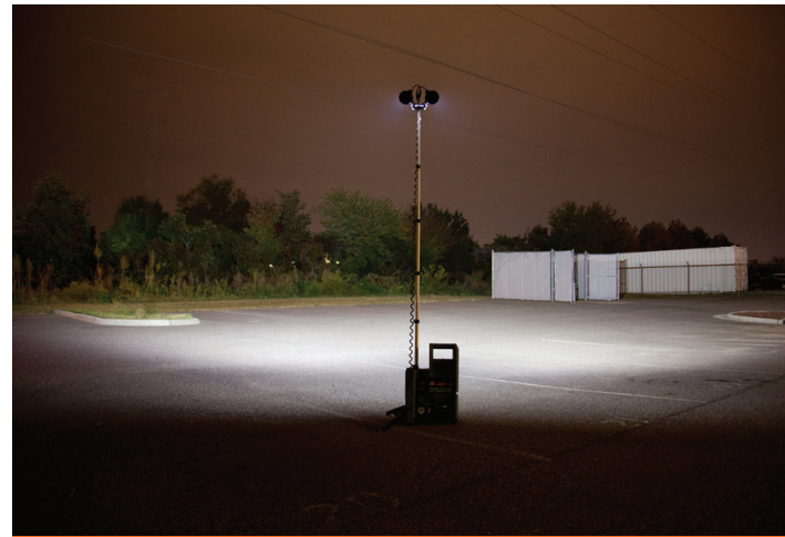
60° Flood Beam Pattern