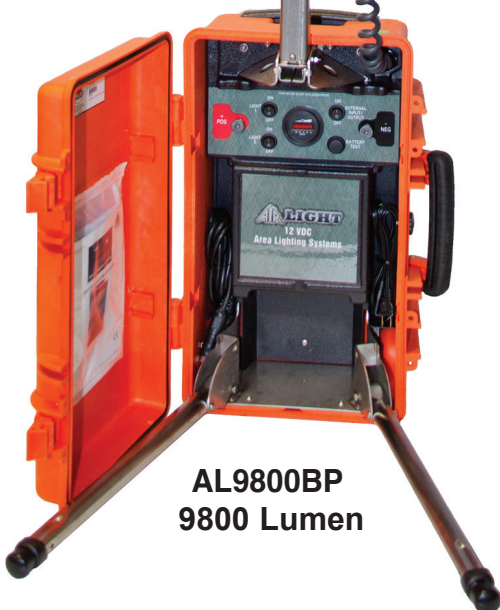
AL9800BP 9800 Lumen