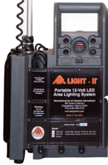
XP Control Panel View 7000 Total lumens Model No. AL2-7-35