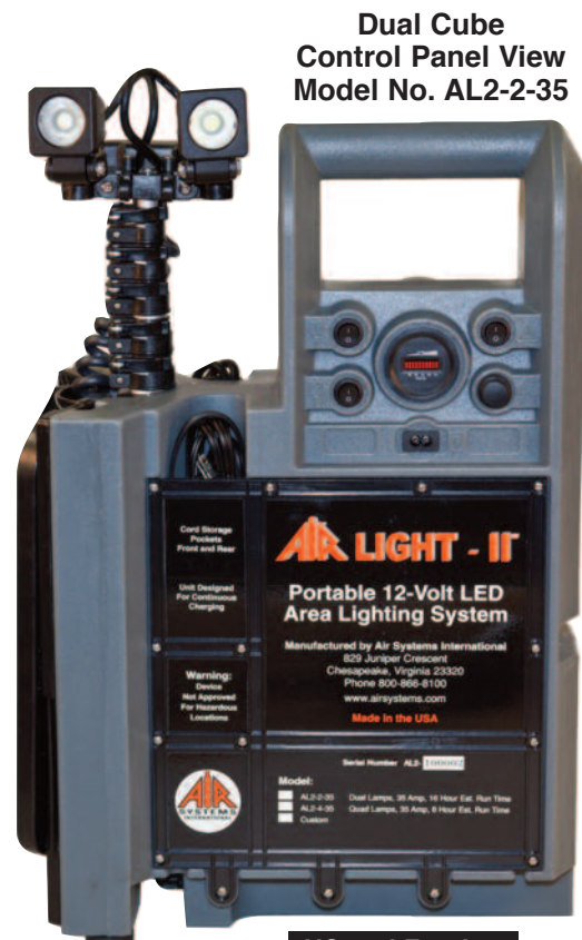
Dual Cube Control Panel View Model No. AL2-2-35