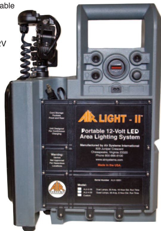
Air Light-II™ Dual Cube