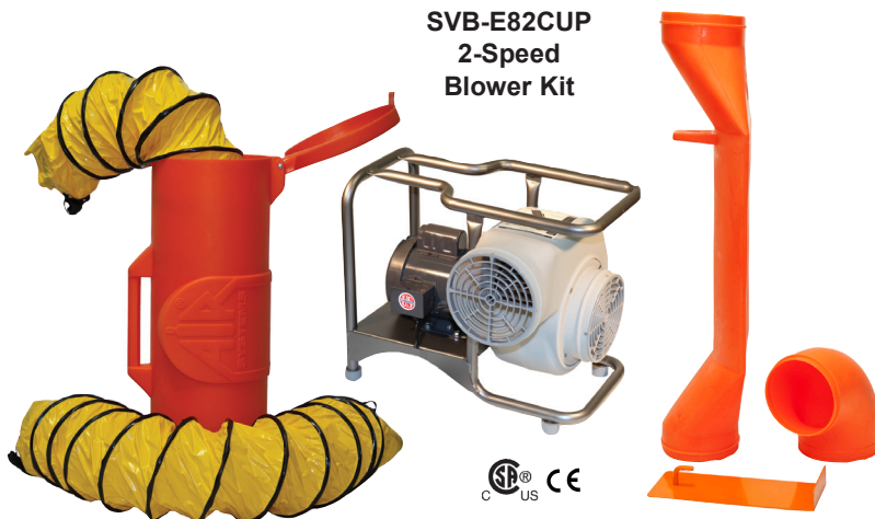
SVB-E82CUP 2-Speed Blower Kit

Fans meet OSHA 29 CFR 1910.303(a) and 1910.7 electric certification requirement.