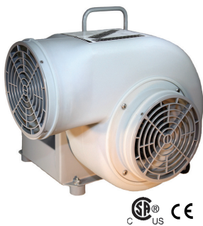
SVB-E8EC Economy Electric Blower