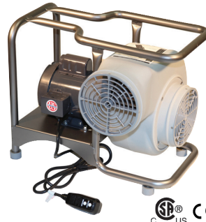
SVB-E8-2 2-Speed Electric Blower