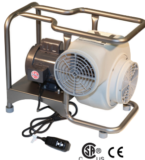
SVB-E8 Single Speed Electric Blower