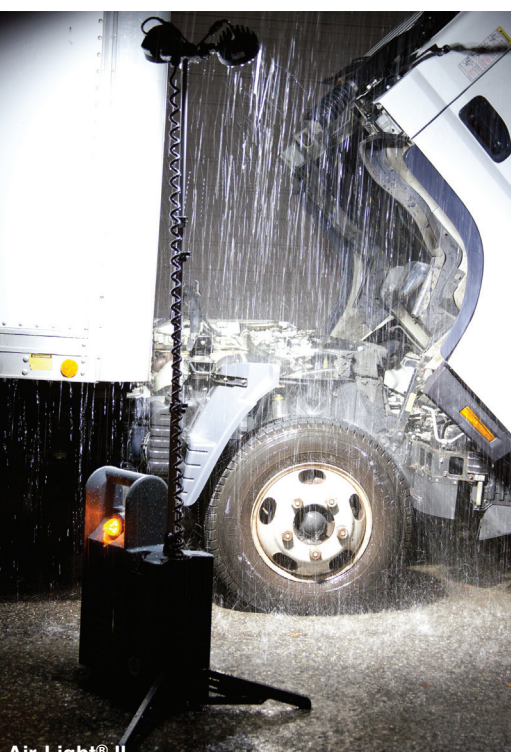
All Weather Lighting