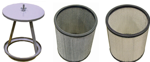
Filter Holder Standard Filter HEPA Filter