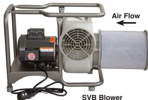
SVB Blower sold separately

The inlet filter is designed for Air Systems' SVB series of portable industrial blowers. The unit filters inlet ambient air so workers in a confined space are not exposed to ambient dust. The system controls dust and particulates from entering a confined space where industrial coatings are being applied. The filter also reduces the potential for dust ignition in a confined space when used with an explosion-proof or intrinsically safe blower. Filters are available with a 5 micron or 99.97% HEPA rating.