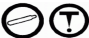
CANADA (WHMIS) SYMBOLS