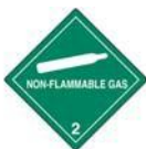
US DOT SYMBOLS