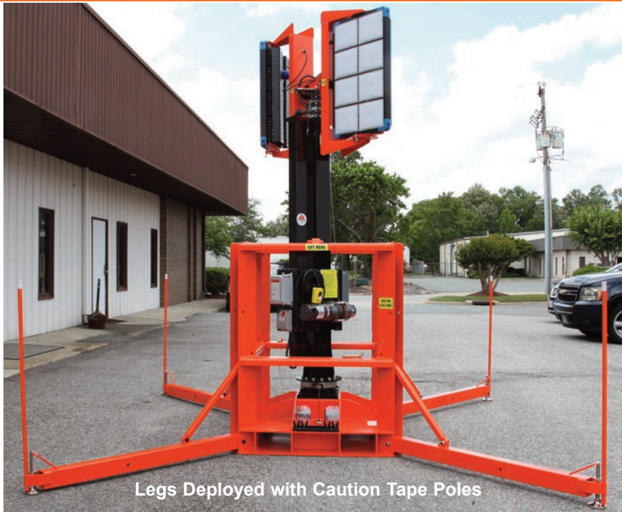
Legs Deployed with Caution Tape Poles