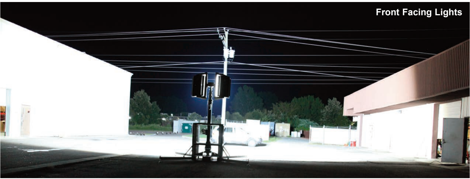
Front Facing Lights

Custom Options Available! Call Customer Service to discuss the perfect light for your application.