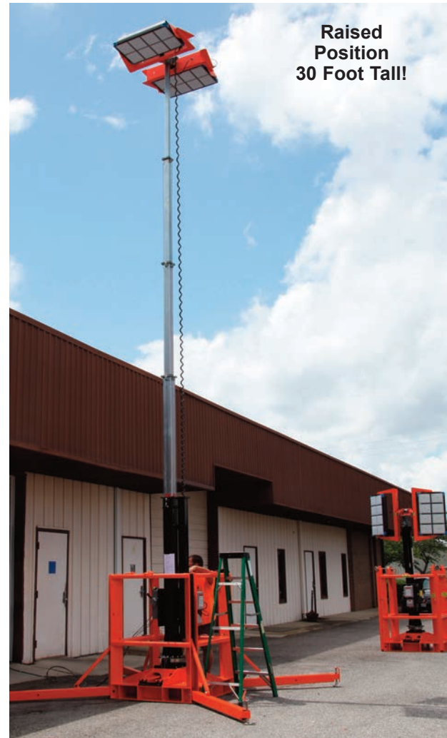
Raised Position 30 Foot Tall!

Air-Light® patent information: www.airsystems.com