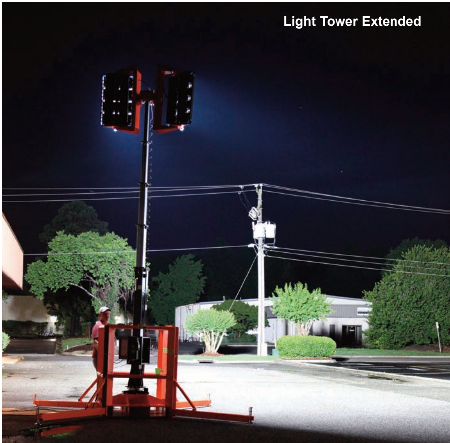
Light Tower Extended

Custom Options Include Electrical Ratings, Custom Colors, & Trailer Version.