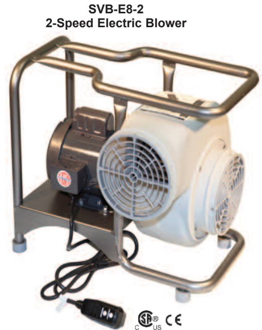
SVB-E8-2 2-Speed Electric Blower