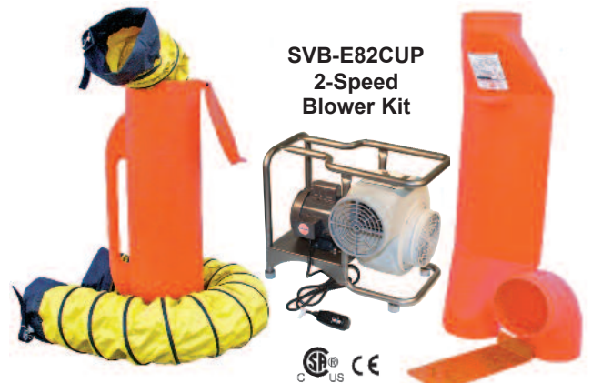
SVB-E82CUP 2-Speed Blower Kit

Fans meet OSHA 29 CFR 1910.303(a) and 1910.7 electric certification requirement.