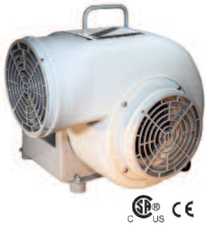
SVB-E8EC Economy Electric Blower