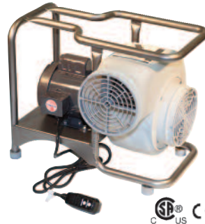
SVB-E8-2 2-Speed Electric Blower