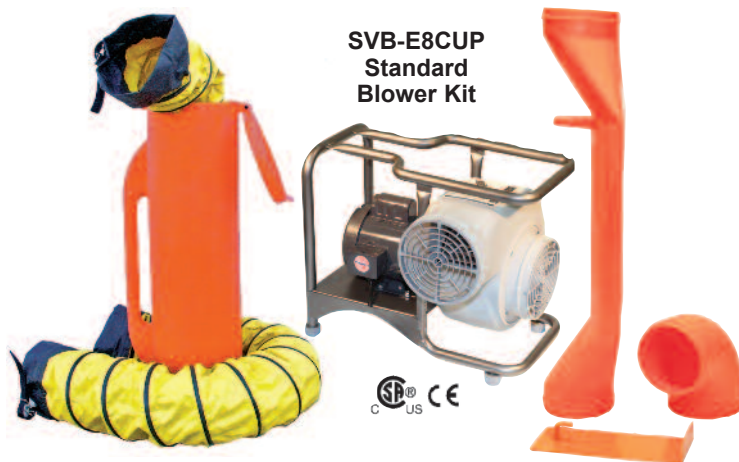
SVB-E8CUP Standard Blower Kit

Recommendation: Once the confined space is determined to be hazardous through the use of a gas detection meter, the correct blower can be chosen to meet the working conditions and available power. Always inspect the blower for loose parts or debris that may cause harm to a worker. Make sure all electric blowers are properly grounded. Make sure all confined space workers are trained on the use and proper application of the ventilation system and all other confined space tools. If there is potential the atmosphere in the confined space could become hazardous, select an explosion-proof or intrinsically safe blower.