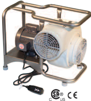
SVB-E8 Single Speed Electric Blower