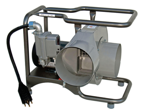
1.5 HP Explosion-Proof motor 8" Inlet/Outlet