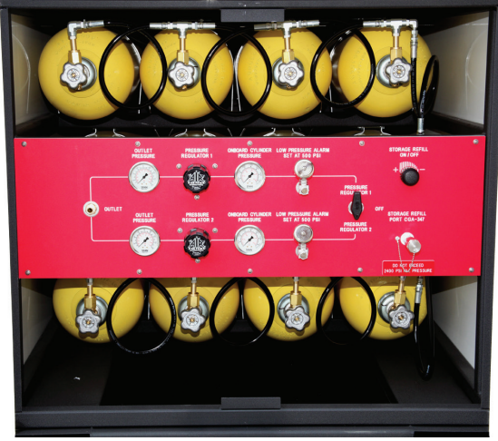
Long Duration Air Storage Hazardous Response Trailers