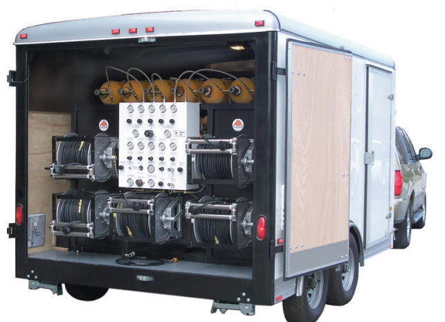
Emergency Response Trailers for Long Duration Breathing and /or Cylinder Filling Applications

6 Cylinder Slide-In Vehicle Rack System for Breathing and Filling Applications