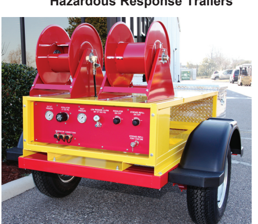
Custom Response Trailer