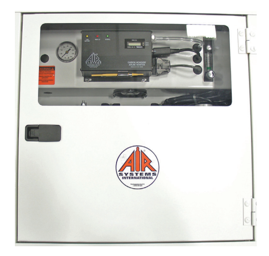
Grade-D Filtration for Clean Room Applications

Fully enclosed breathing air trailer with fill compressor, air storage cylinders, and fill containment station