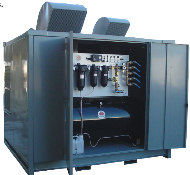
Custom Plant Breathing Air System