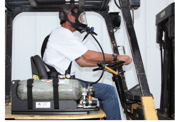
PAK-SFL™ mounted on forklift