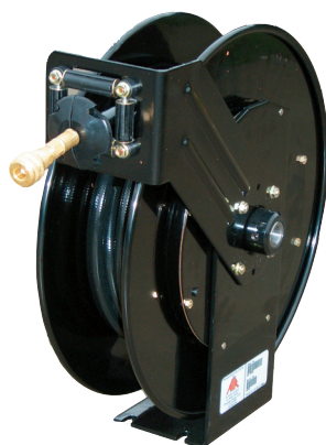
HR-50 Automatic Reel

Replace XX with number of feet required - example: HR-50POA holds 50 feet of hose.