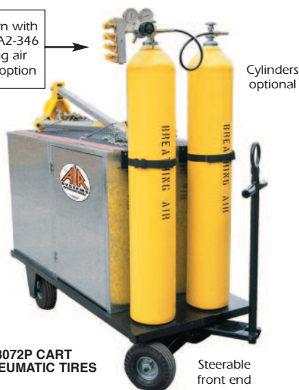
CSC-3072P CART WITH PNEUMATIC TIRES

Cart shown with Model CBA2-346 breathing air assembly option